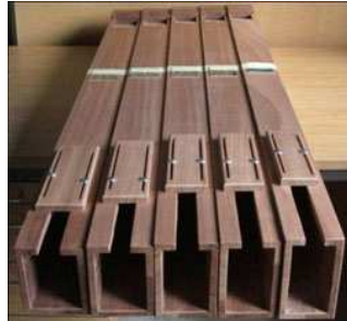
Wooden pipes with different scaling setups

Organ building is a traditional craftsmanship deeply rooted in Europe's history and culture, which entails valuable know-how transmitted generation after generation. The organ builder SMEs have recognized that the quality and the effectiveness of their work can be considerably enhanced by adopting scientific and technological innovations in their craftsmanship. The EU funded, collaborative research projects aim at developing innovative design methods, technologies and software, which can be applied in the daily practice of organ building in order to optimize the design and production of labial and reed organ pipes and, more importantly, without endangering the valuable traditions inherent to their fabrication.